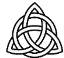
Celtic Trinity knot